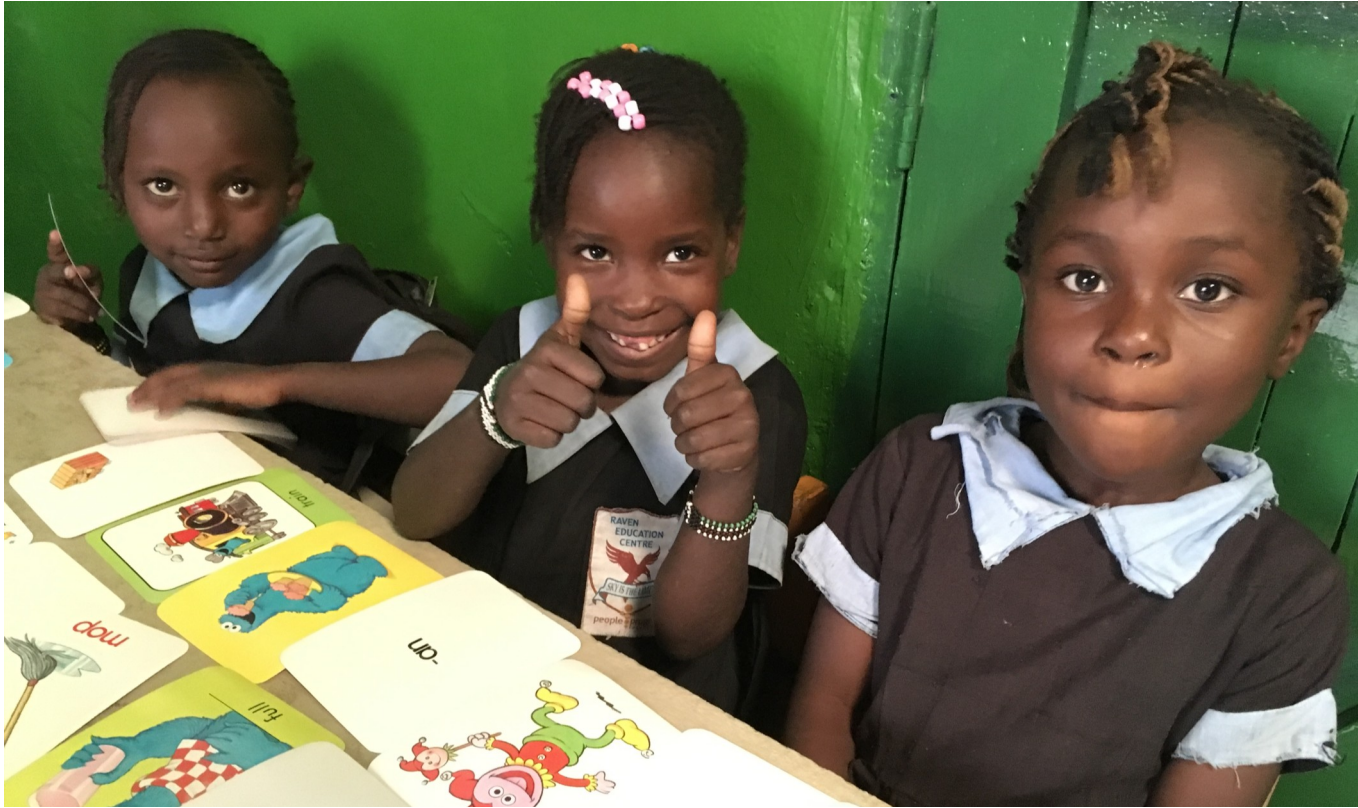
Raven Education Centre pre-unit students learning with flashcards in their newly painted classroom.