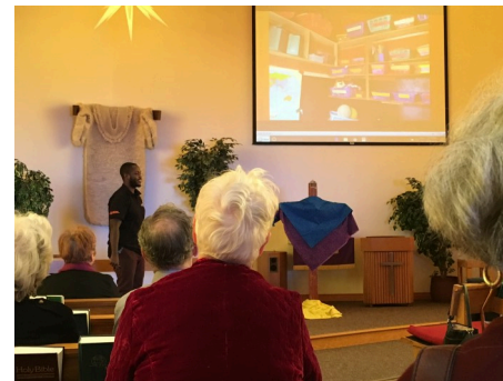
Making a presentation at Christ Moravian Church