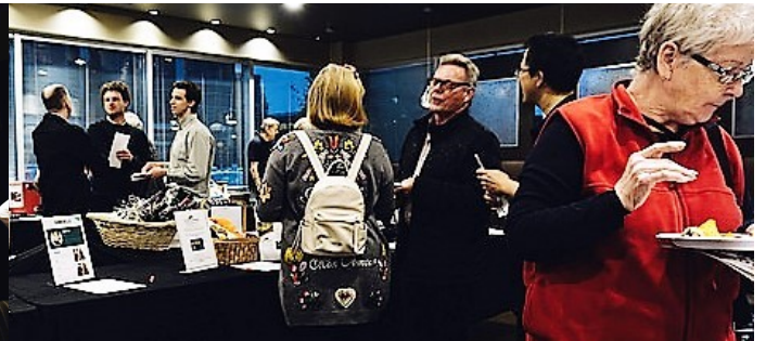
Networking and Silent Auction