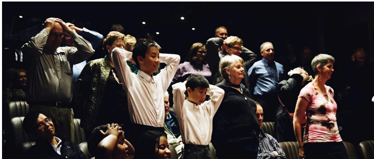
Heads and Tails