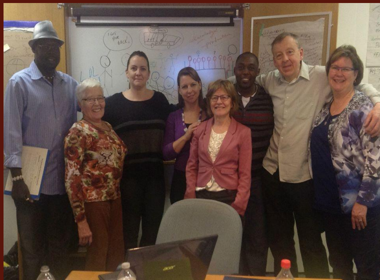
PPPF Calgary Board Members and Government of Alberta Board Development Program Staff

People for Progress Foundation Board Members and Committee leads participated in a board development workshop facilitated by the Government of Alberta Board Development Program. This two day workshop focused on building governance policies and developing an action plan for the future. We look forward to following up on the many action items produced from a wide variety of brainstorming and team building activities. Special thanks goes out to the Board Development Program and their facilitators for offering this valuable opportunity.