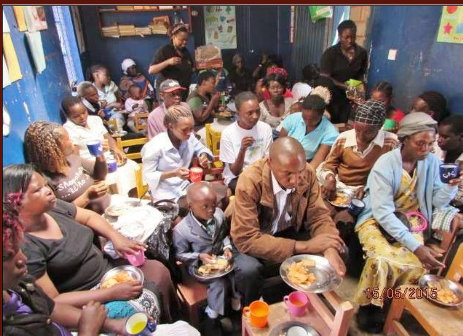
Parents and students gather together for a parent teacher meeting