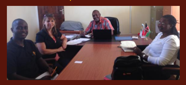
PFPF Meeting with DRA and UN