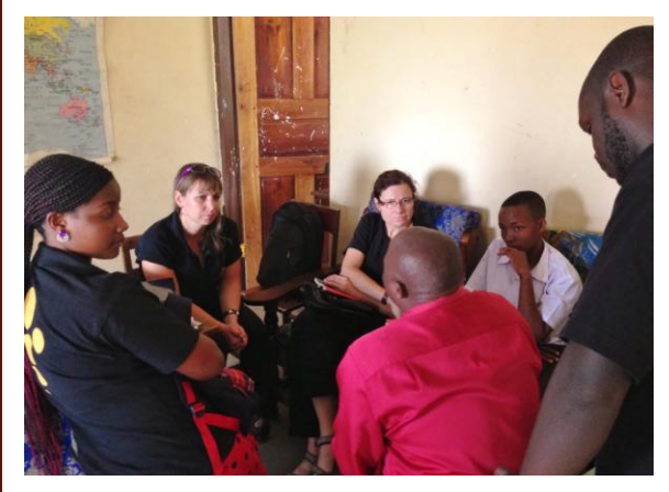
Msufini Secondary School, Tanzania