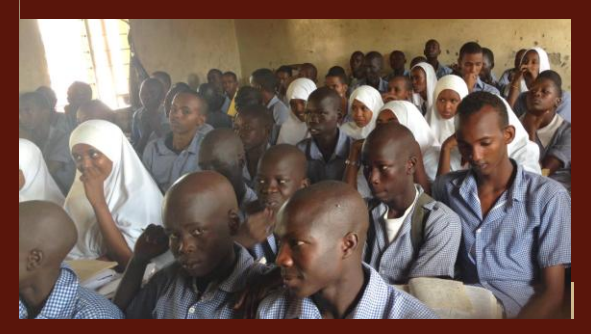
Kakuma Primary School