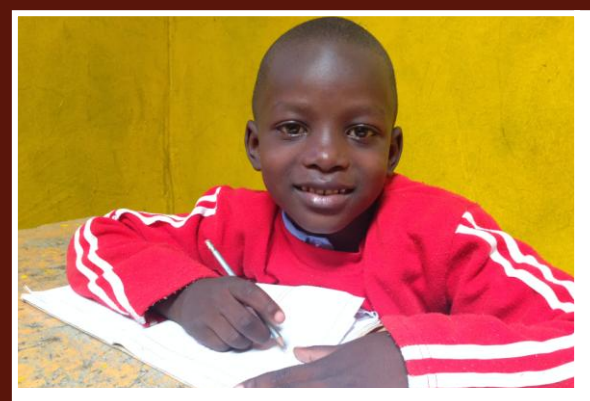
Raven Education Centre Pre-Unit Student