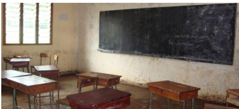
Public Secondary School in Machame, Tanzania