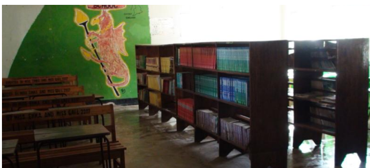
Library at Msufini Secondary School in Machame, Tanzania.